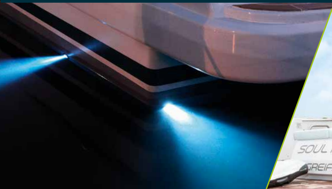
coloured courtesy lighting