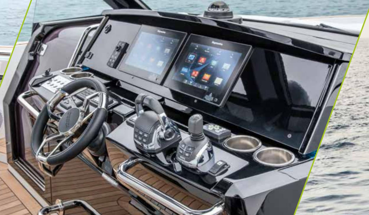
stylish and clearly arranged dashboard