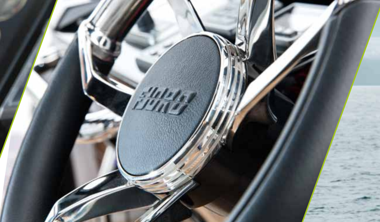
exhilarating driving experience