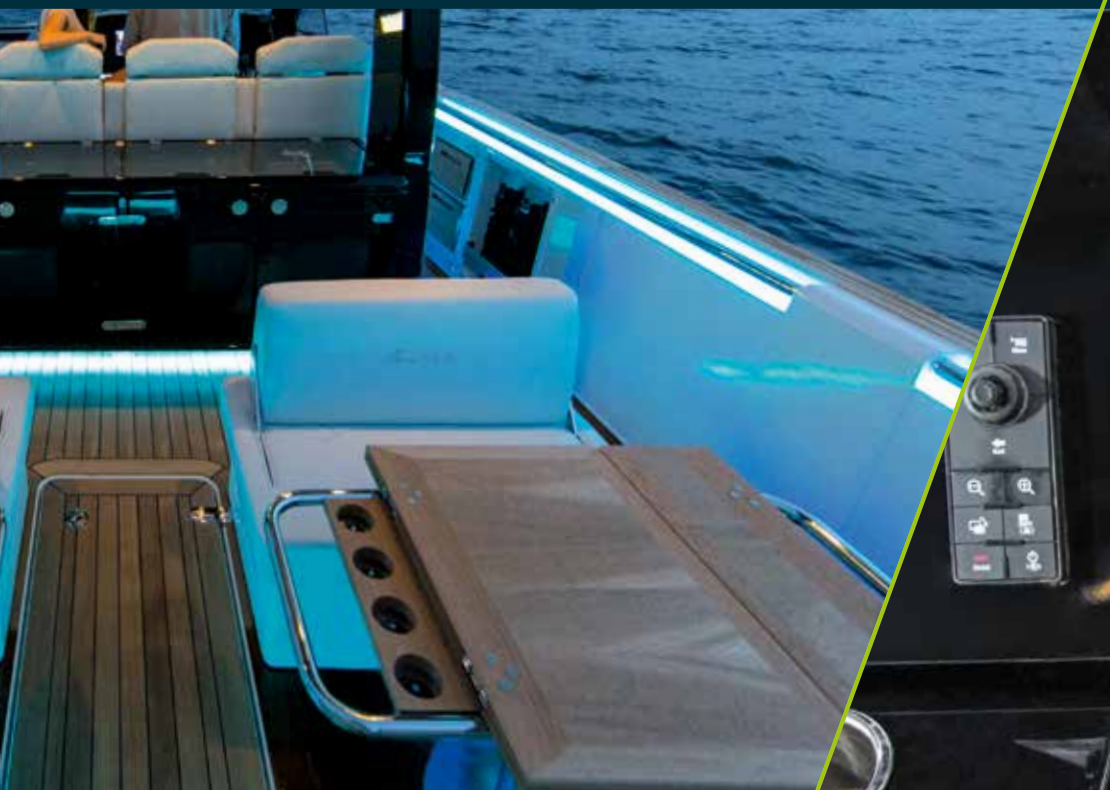
up to 16" Raymarine chart plotters