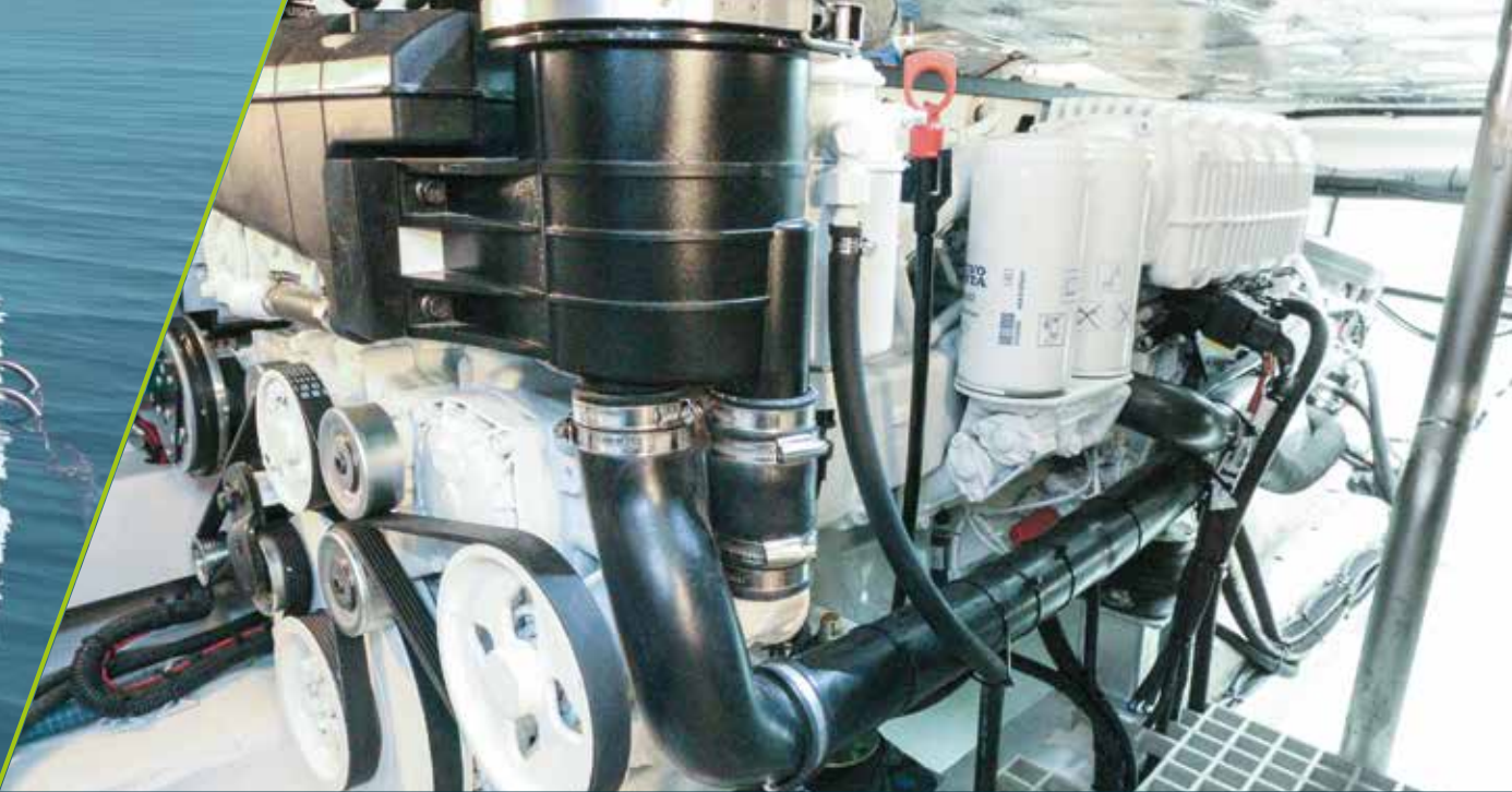
IPS600 double engine