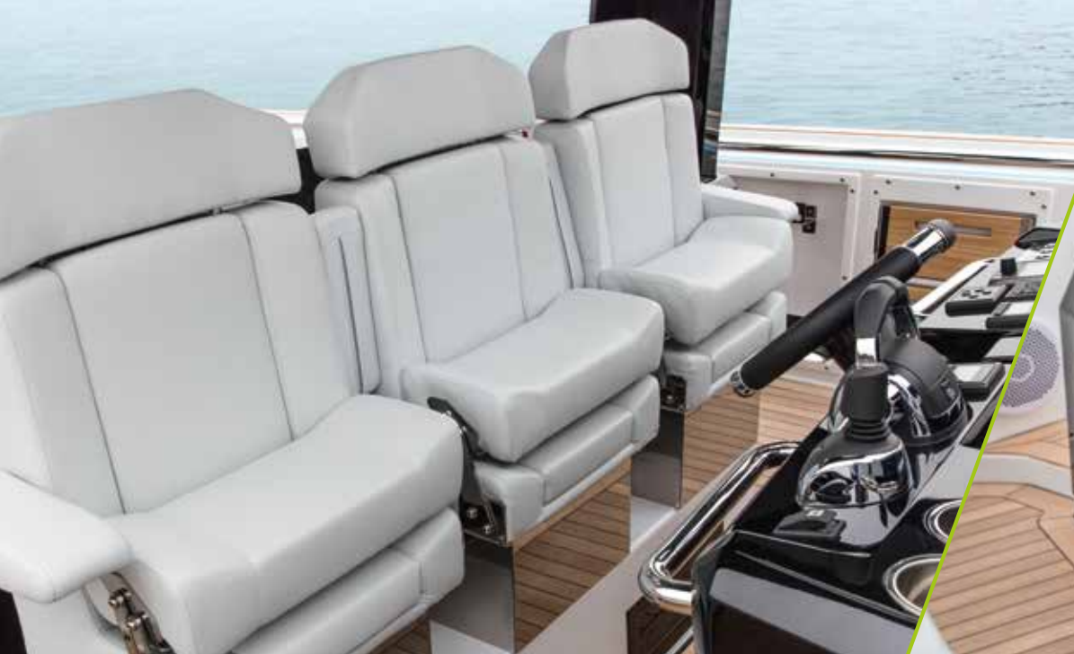
smart seat design for standing and sitting position