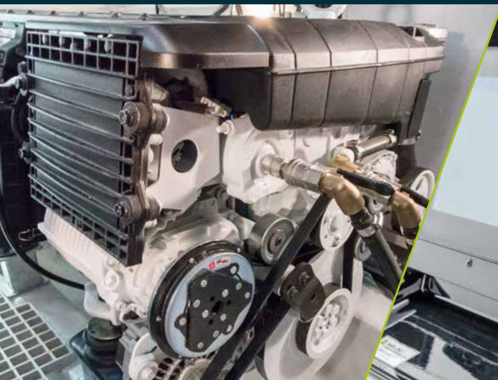
powerful double engine