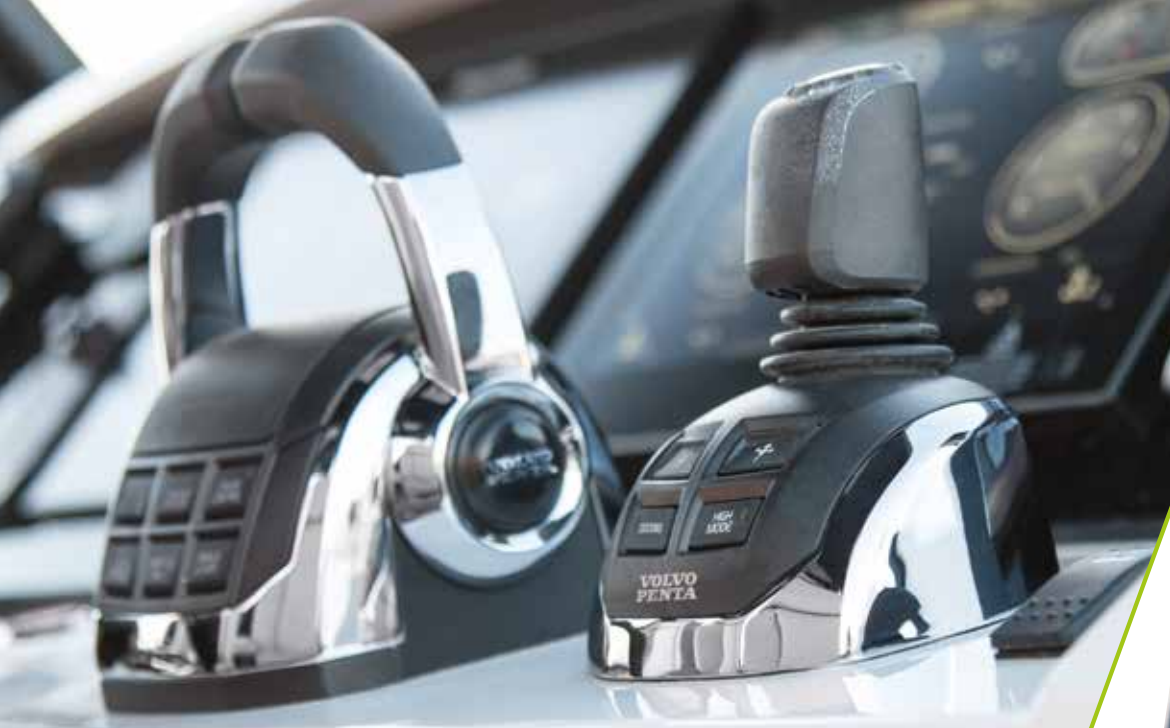
relaxed joystick-manoeuving from the helm