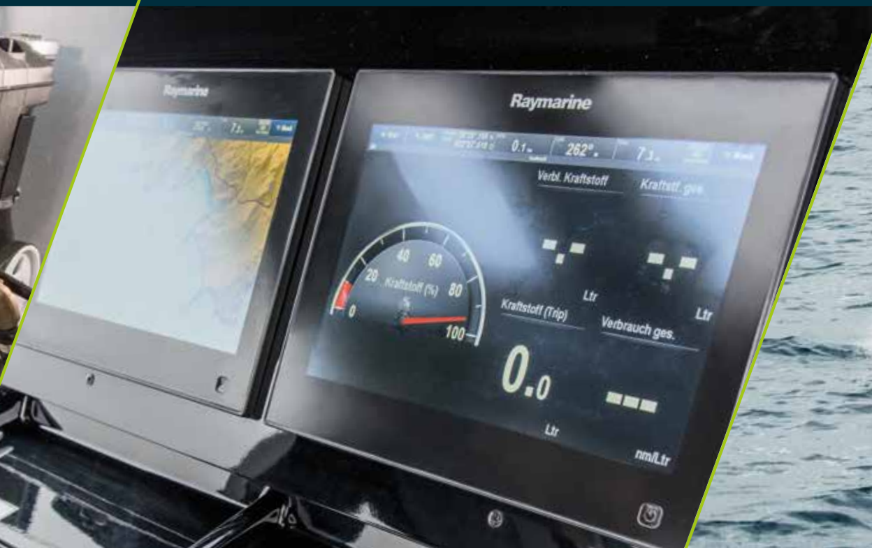
double chart plotters