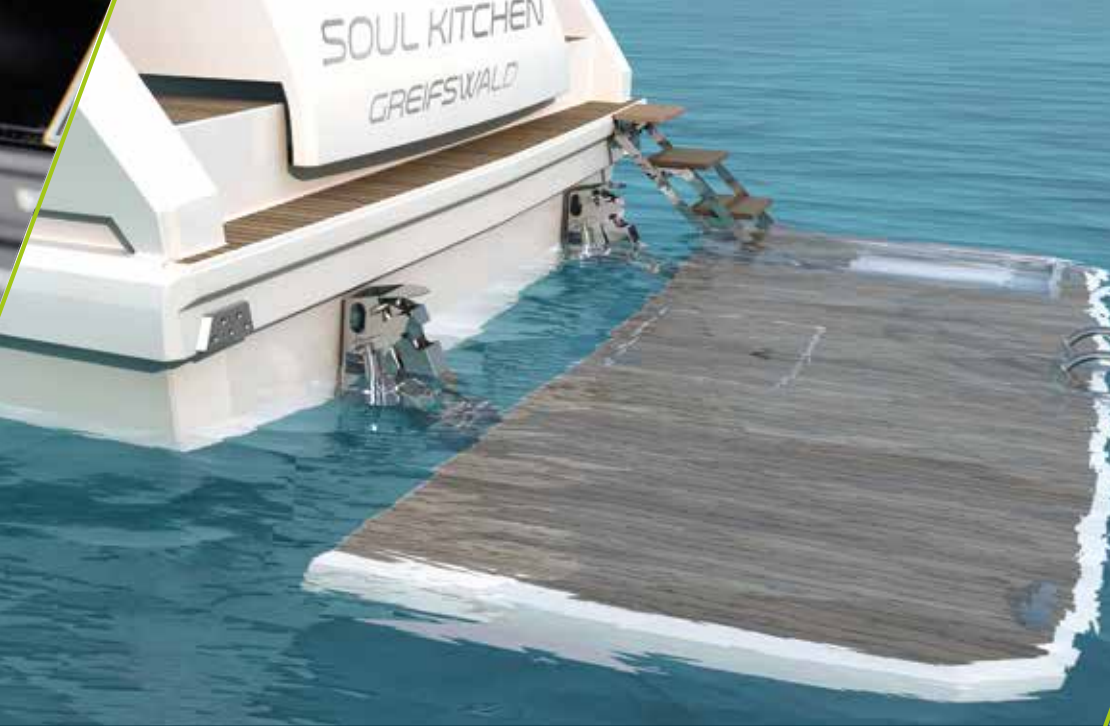
hydraulic bathing platform